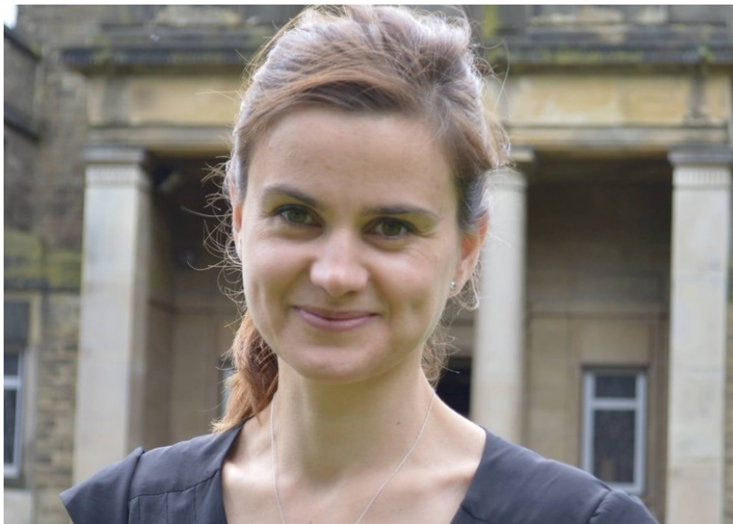
The late British MP Jo Cox, 1974-2016

History shows that the Invisible Government routinely advances its agenda through assassinations. The 2016 tragic murder of British Member of Parliament Jo Cox advances that Government's agenda. Hence, that Government is the prime suspect in Jo Cox's murder.