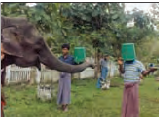
Figure 4. Buckets condition, elephant is seen begging from a person who cannot see the begging posture.

Extensive additional experiments with 14 logging elephants in two geographically isolated logging camps in Burma (complete descriptions will be published elsewhere and can, as well, be accessed at www.is.wayne.edu/mnissani/ElephantCorner/do_elephants_know_that_people_see.htm ) resorted to numerous controls and variations. These experiments lent support to previous studies of chimpanzees and elephants. Here too elephants performed well in the three background conditions and in some experimental conditions. They performed at about chance level in other conditions, even though these conditions were conceptually similar to the others and did not require greater visual acuity.